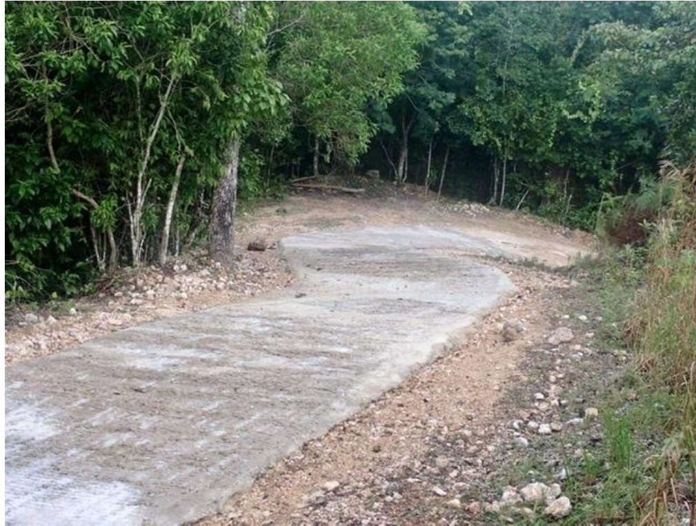
At the foot of Eagle's Landing heading to the turn off for Hibiscus Heights